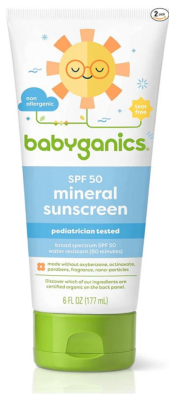
Babyganics SPF 50 Sunscreen Lotion

Aside from the convenience of using the same products as your kids, there's a reason any adult should use child-friendly skin care: it's built to be as gentle as possible. Dr. Mehr recommends Babyganics SPF 50 Sunscreen Lotion , which contains six percent zinc oxide and three percent titanium dioxide.